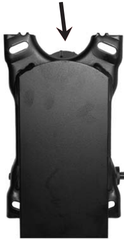
Q31 Heavy Duty Swivel Tilt

Tilt Resistance - Turn the Hand Wheel counter clockwise to increase the tension for heavier people, clockwise to decrease the tension for lighter people.