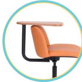
Tuck Away Arm