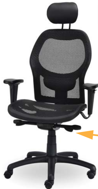
ASD Option Adjustment Lever for Q25 and Q35 Mechanisms

Seating Inc. specializes in offering to you the BEST ergonomic design possible.