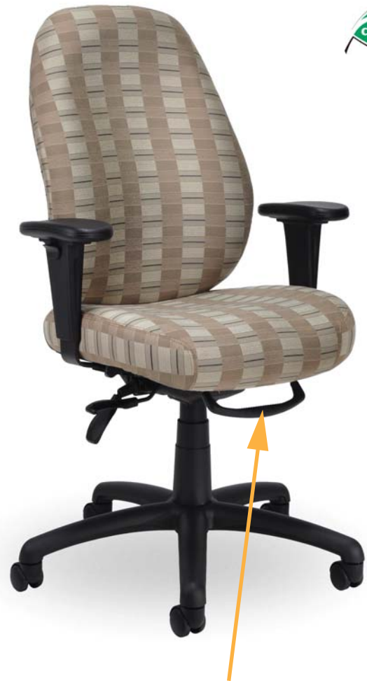
ASD Option Hand Bar Adjustment Lever Ergonomically Accessible!