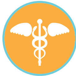
employee health & safety