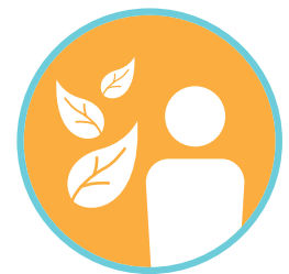
human and ecosystem health impacts,

level® verifies how a product has met the ANSI/BIFMA e3 Furniture Sustainability Standard from multiple perspectives. With level®, customers can make informed choices about commercial furniture that exceed single attribute eco-certifications.