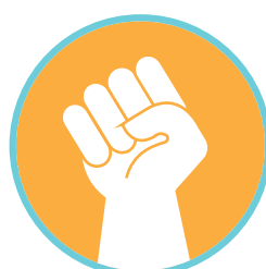
labor & human rights