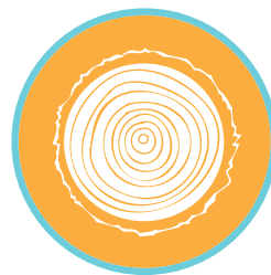
material selection and