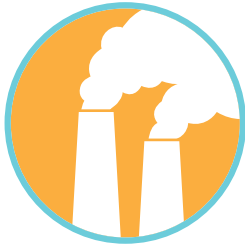
greenhouse gas emissions