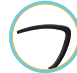
C-style black polyurethane (BPA)