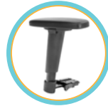
T-style arm angled 4-Way adjustable (T4)