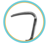
C-style polished aluminum (PAA)