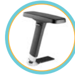
T-style arm angled 5-Way adjustable (T5)