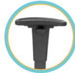
T-style arm (TC)