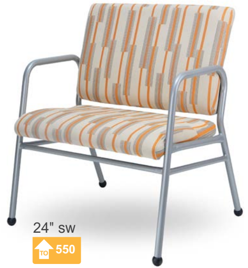
24" sw ↑ to 550