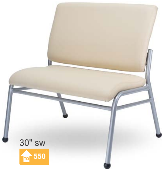
30" sw ↑ to 550