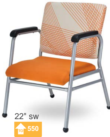
22" sw ↑ to 550

Bariatric chair armless with silver metallic finished frame (HE543-30 SM).