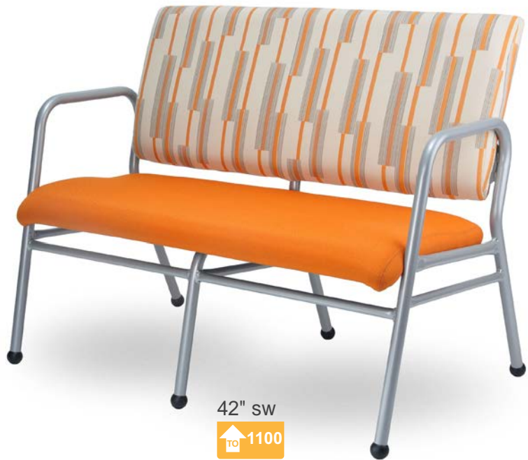
42" sw ↑ to 1100