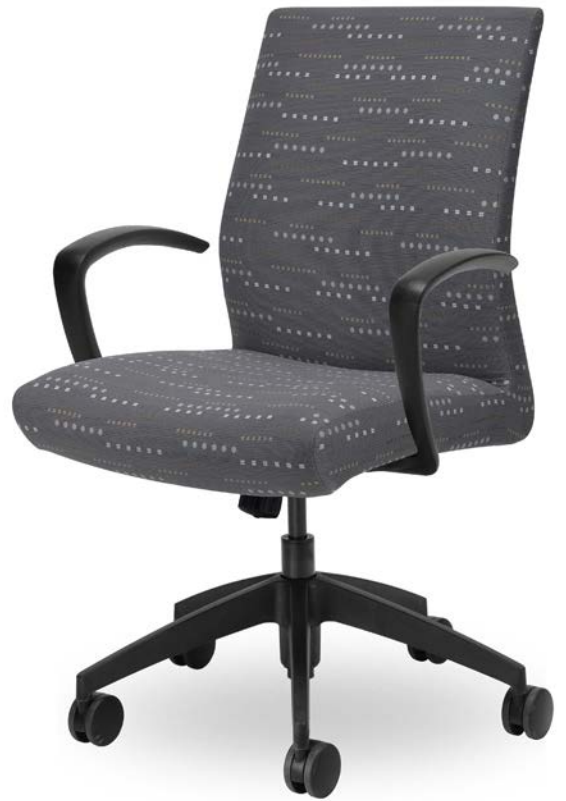
Pictured: KA200 E21 PAA PAB High back swivel with polished aluminum arms and polished aluminum spider base; KA201 E21 BPA Medium back swivel with C-style black polyurethane arms and black spider base.