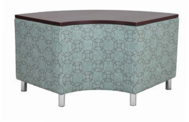
model # DTQR-18 LRC