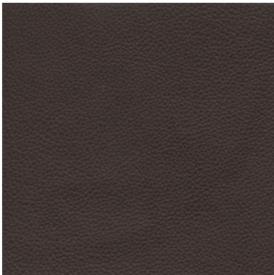
Evolution Java (Brown)