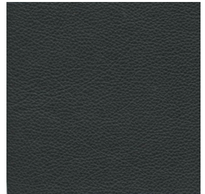
Evolution Nocturnal (Black)