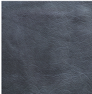
Evolution Smokey Shadow (Grey)