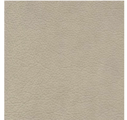
Evolution Pumice (Beige)