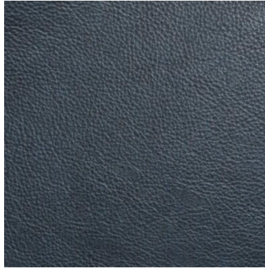
Evolution Deep Blue (Navy)