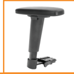
T4 - $135

C-style, polished aluminum with black no-slip pad. Fixed height and width.