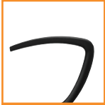
BPA - $118

C-style, black, polyurethane. Fixed height and width.