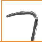
PAA - $202

C-style, black, polyurethane. Fixed height and width.