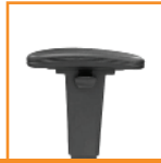
BPA - $122