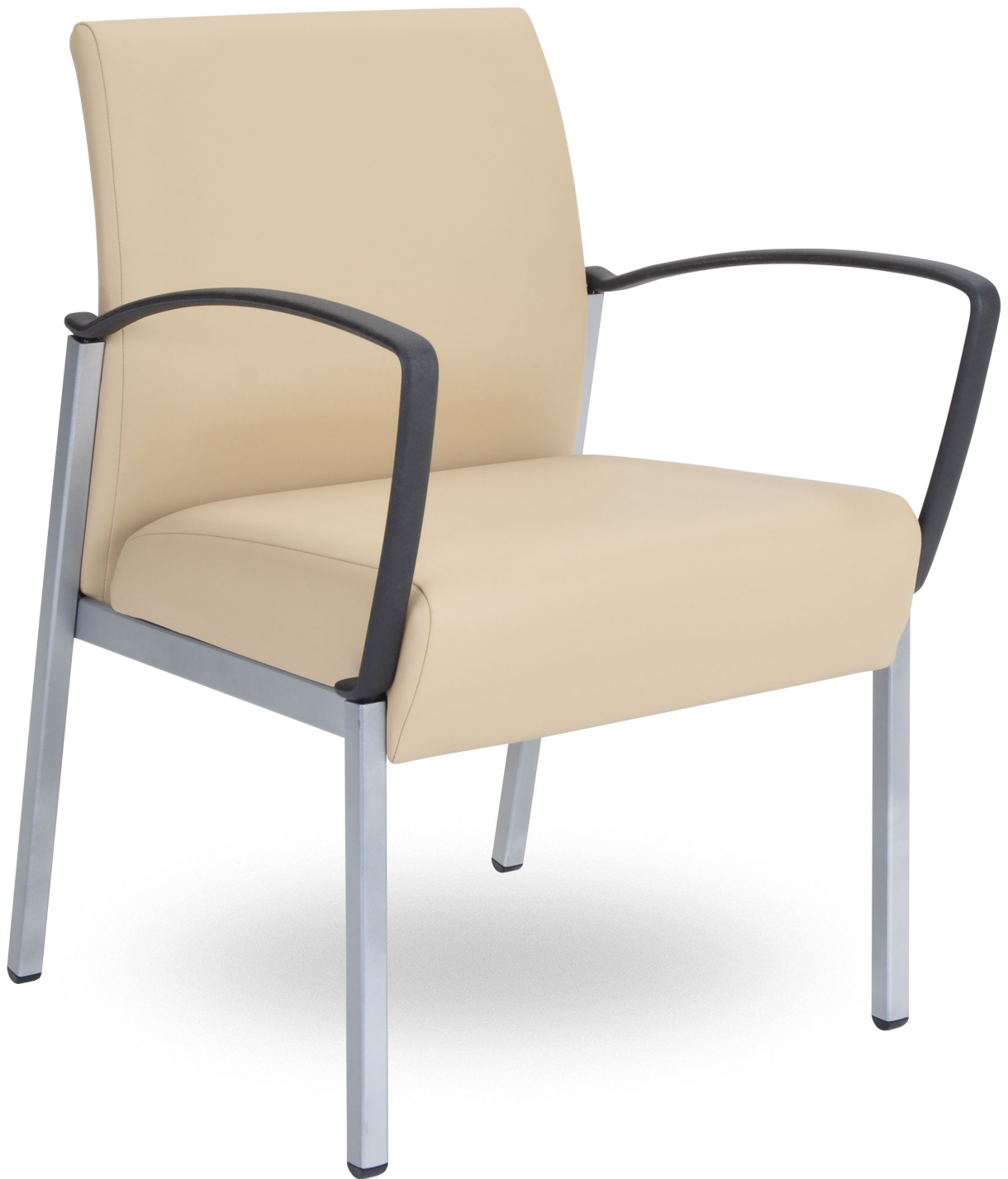
Cobra Guest 24"