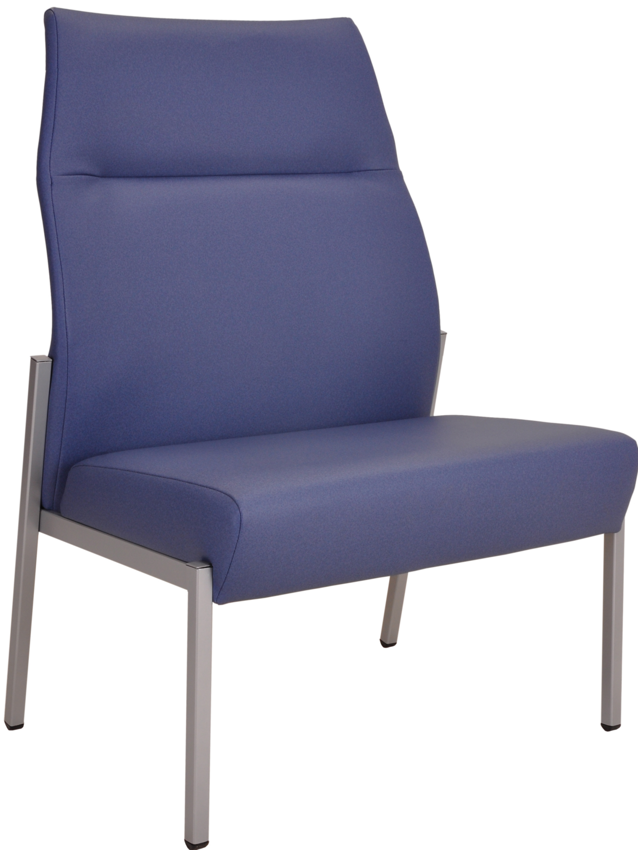
Cobra Patient 30"