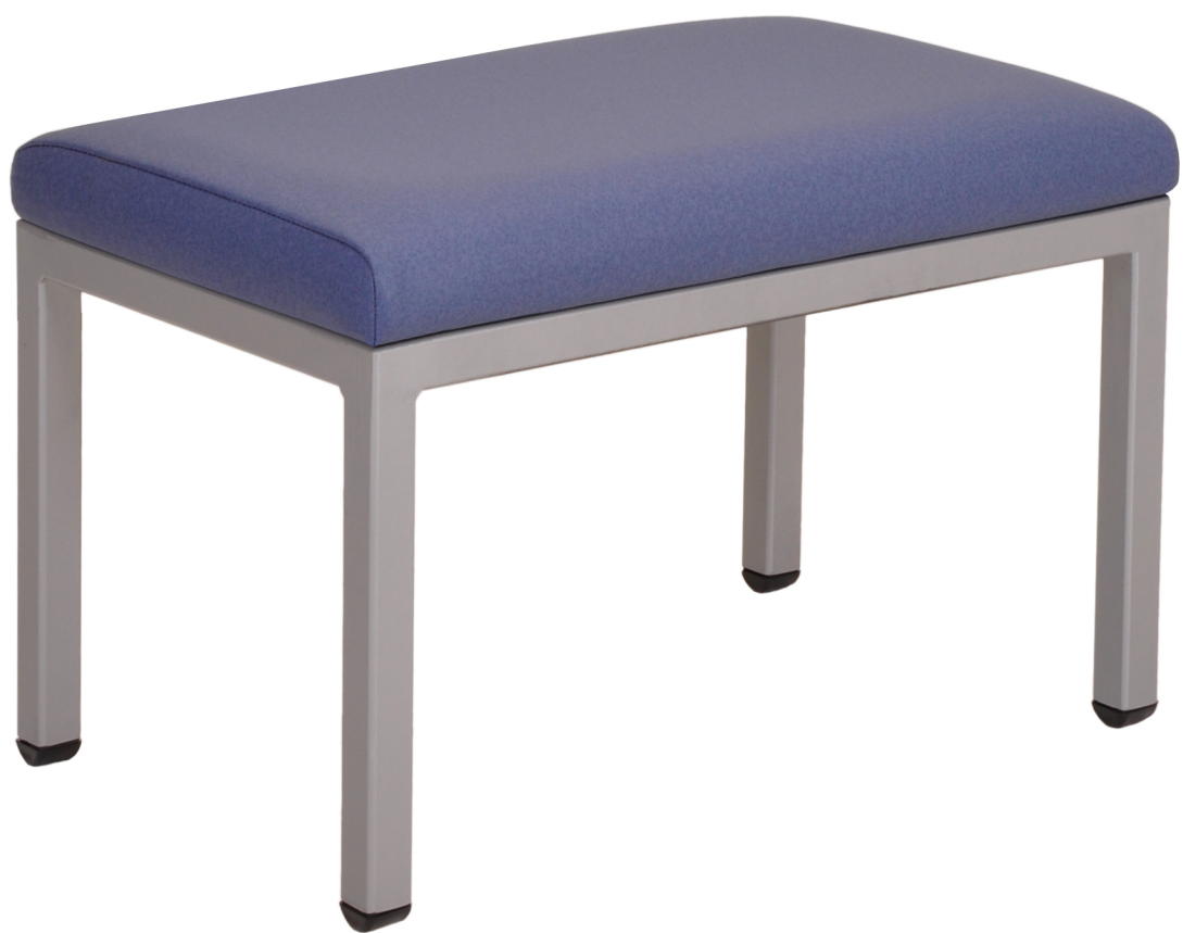
Cobra Foot Rest