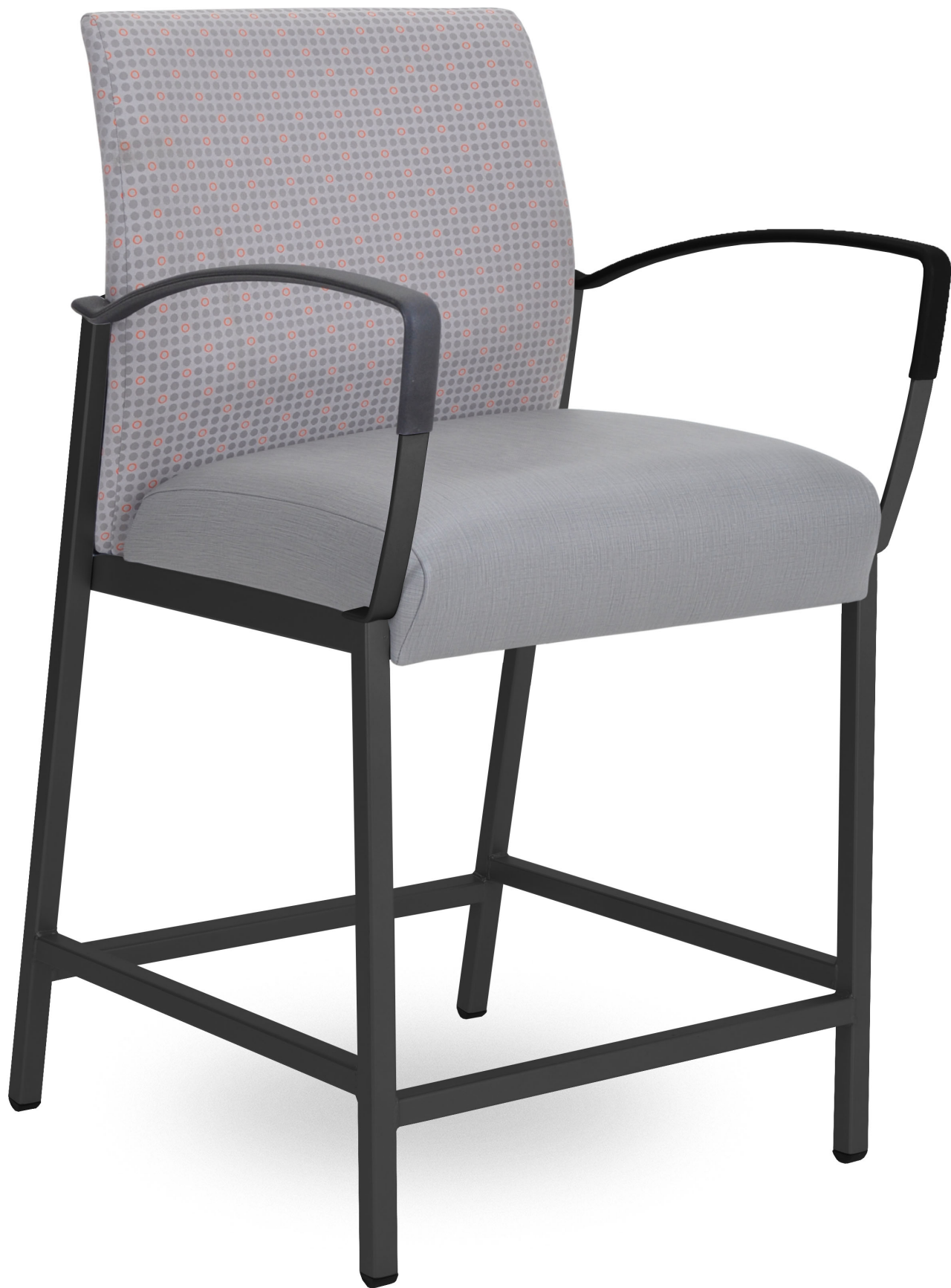
Cobra Hip Chair-21"