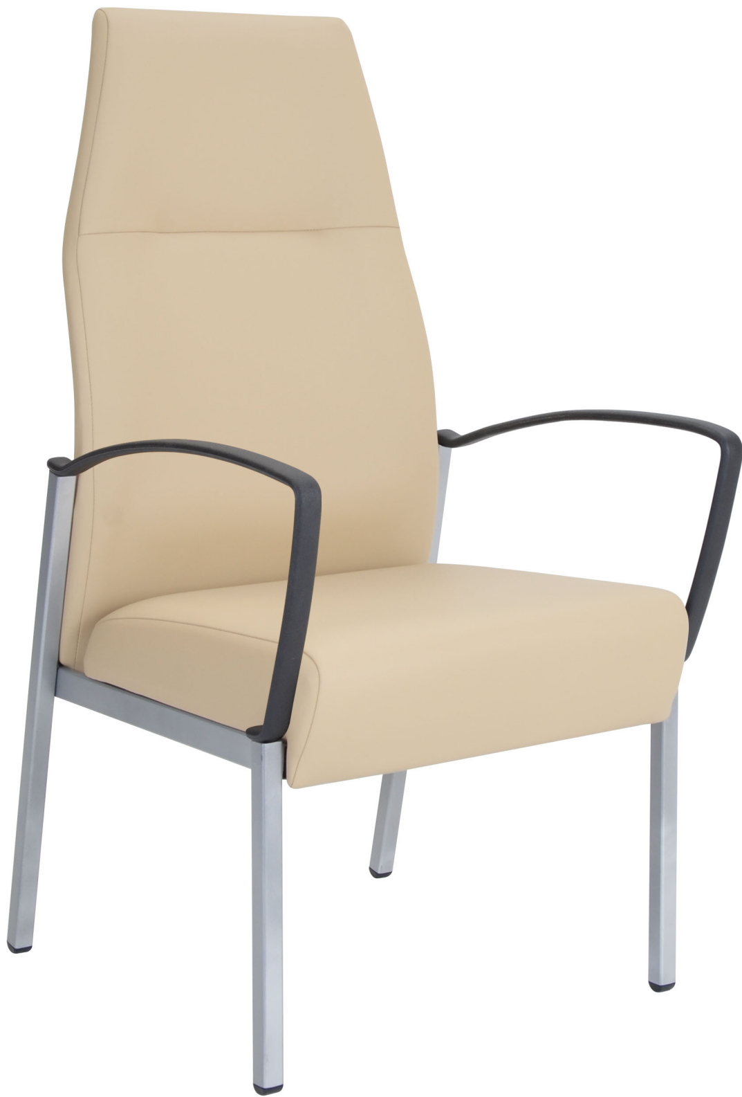
Cobra Patient 21"