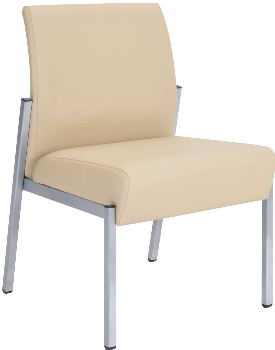
Cobra Guest 21"