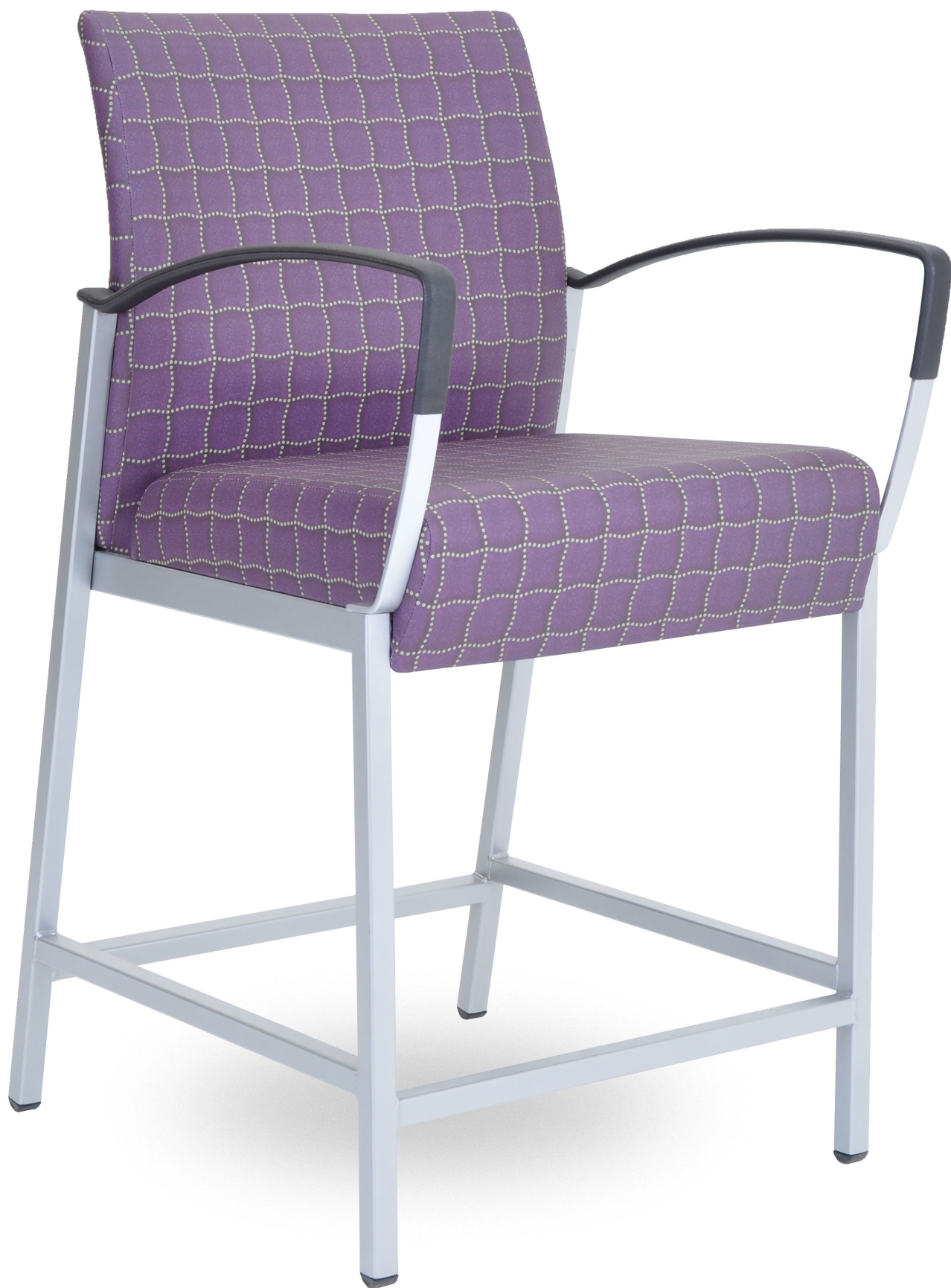
Cobra Hip Chair-24"