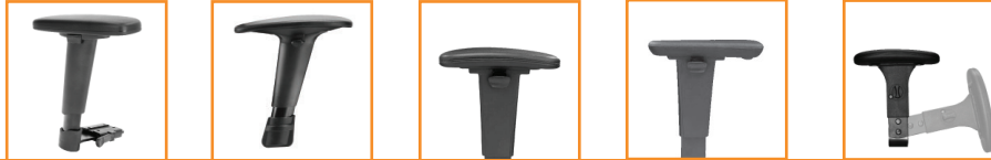
T4 - $195

T-style, angled, with urethane pad. 4-way adjustable.